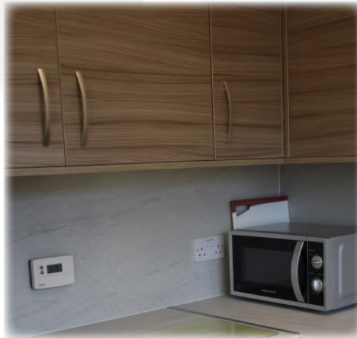
Completed Refurbished Works - Ardfin Area Prestwick